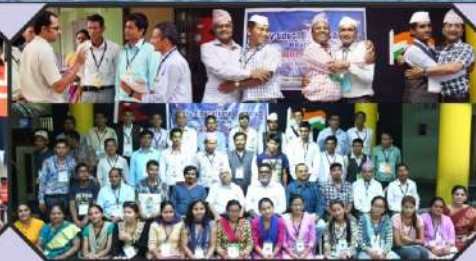
Educator's Corridor: 41 teachers from Nepal visited Amity Educational Campus for Cultural and Educational observances Dt.29/07/16