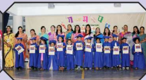
Udaan: A convocation ceremony for U.Kg. Students of Amity Play Centre. Students presented cultural program on the theme "Sur Sangam" Dt.11/02/17