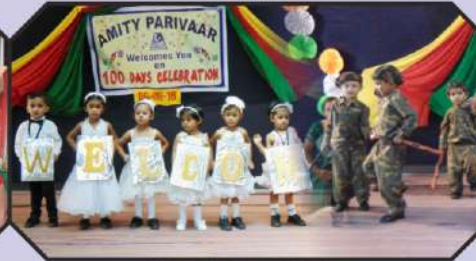
100 days celebration by Amity Play Centre CBSE (6 th Aug'16) and GSEB (10 th Sep'16)