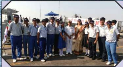
On the occasion of National Navy Week, Chief Captain and Captains of Amity students' council visited INS Mysore which was docked at Dahej Port Dt.09/12/16